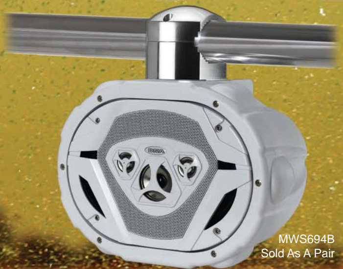
MWS694B Sold As A Pair