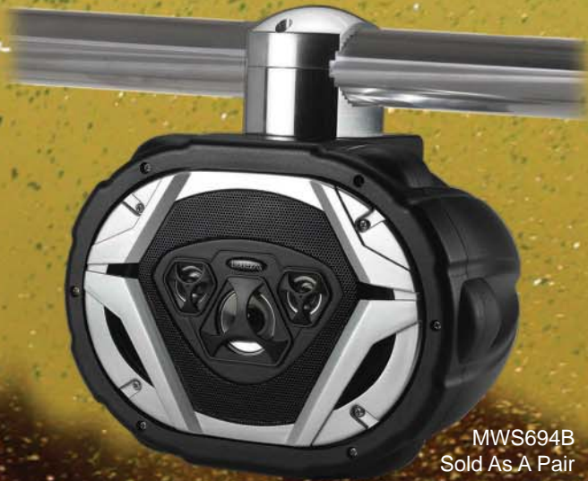
MWS694B Sold As A Pair